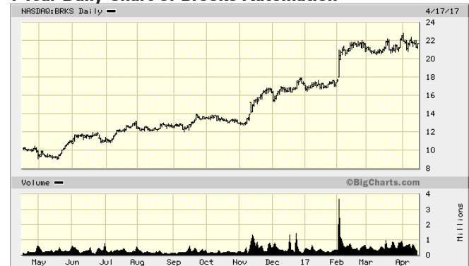
1-Year Daily Chart of Brooks Automation